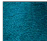
Teal Blue (125)