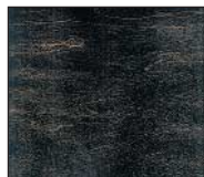
Black Mist (122)