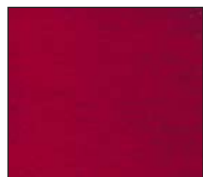
Sequoia Red (110)