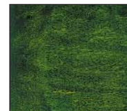
Emerald Mist (126)

Other colours are available for special order and delivery