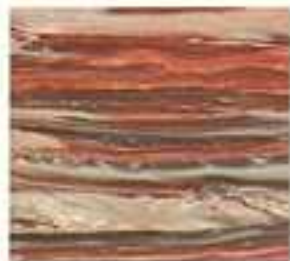
030 PINK STRATA PEARL