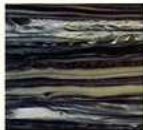
032 BLACK STRATA PEARL