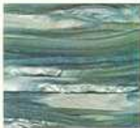
031 BLUE STRATA PEARL

Swiv-a-matic®/PowerTone® and Rogers® Drums are registered trademarks of CBS Musical Instruments, a division of Columbia Broadcasting System, Inc., 1300 E. Valencia, Fullerton, California 92631.