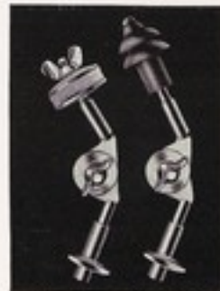
No. 1307 No. 1308