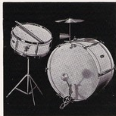
1093 President III