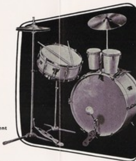
1092 President II

PEARLS (Plastic) Black, Blue or White GLITTERS (Plastic) Blue, Gold, Green, Red or Silver. LACQUER Black or White.