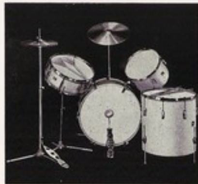
1091 President I