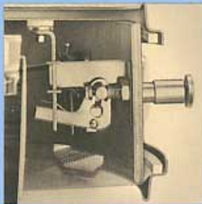
Parallel working, two-point-contact muffler has a special "on-off" control for instant response.