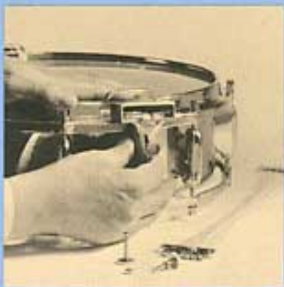
Self-aligning snares and strainer with 12 adjustable snares are easily interchanged.