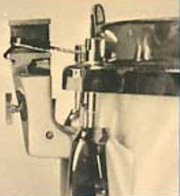
One-point-contact, self-aligning strainer built so all 18 snares rest evenly on the head.